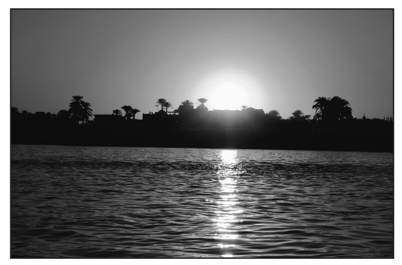
The Nile River at Luxor

And that leads us to consider Pharaoh's daughter. We don't know anything about her except that she saw the Hebrew child and, despite knowing what her father had decreed regarding Israelite boys, felt compassion and pity for the child and was moved to adopt him. How easy it would have been for her to have left the child there in the basket on the banks of the Nile, perhaps fearing her father or believing that surely someone else would save him. But instead her compassion led her to lift the child from the water, risk her father's wrath, and take him home, adopting him as her own child.