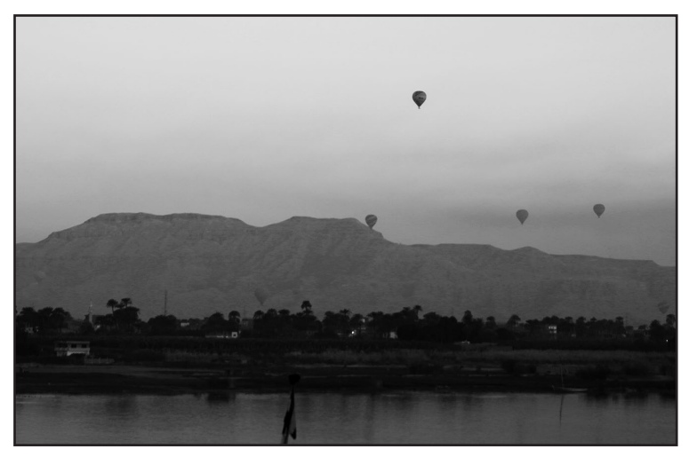
Hot air balloons at sunrise over the Valley of the Kings

photos of some of these locations, and in the video designed to accompany this book I will take you to these locations.